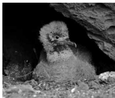
Young seabird chick = do not collect

PROCEDURE: Approach the fledgling from the rear and gently pick it up with a towel. Place it in a covered and ventilated box. Do NOT give it food or water.